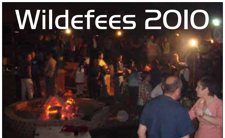
General revelry to herald the arrival of spring. The Wildefees rocks!