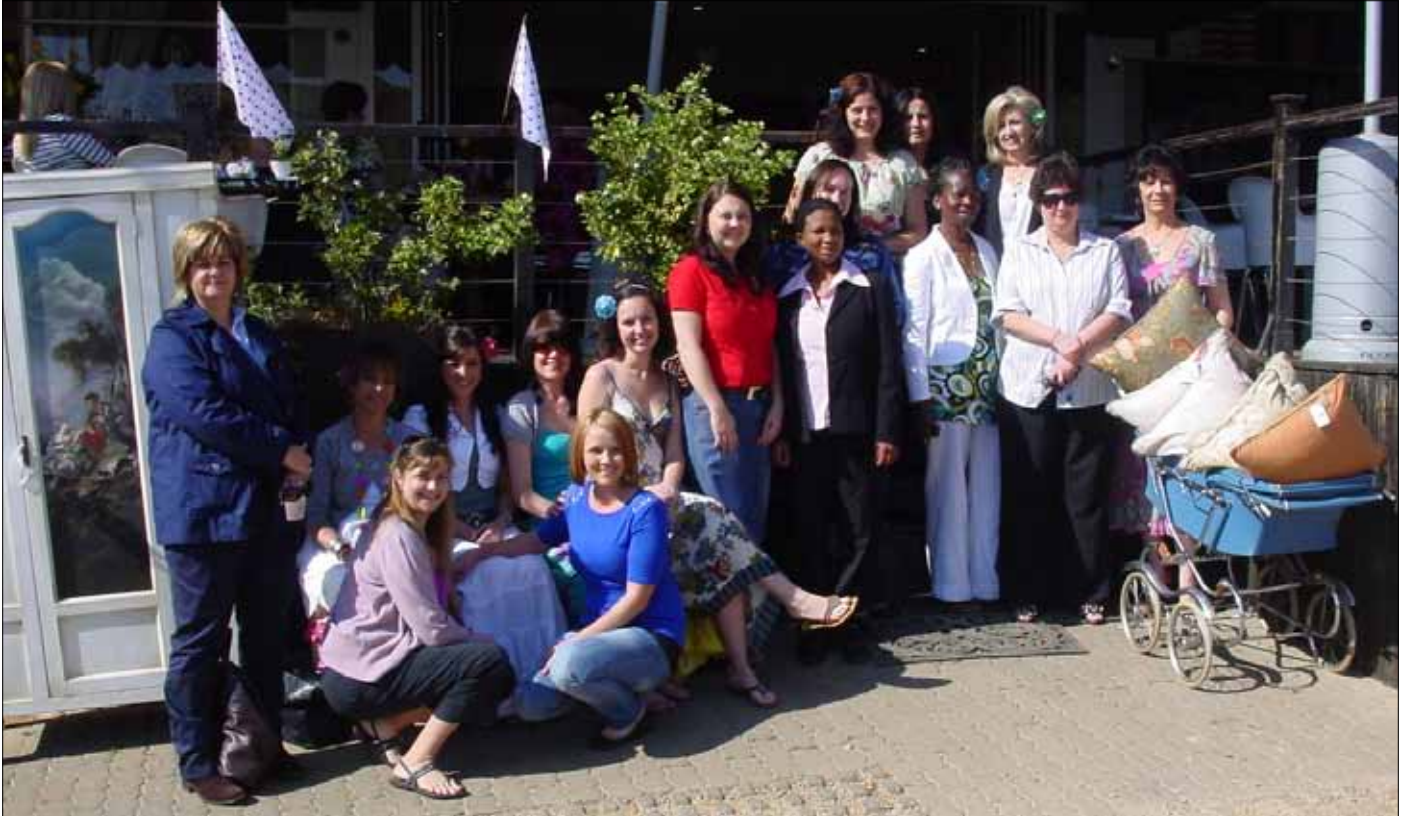
Below: IRITRON's feminine "force"