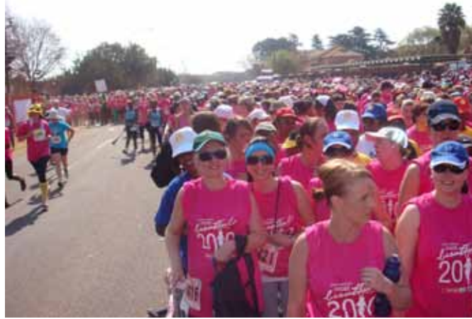
Streams of pink clad people (+/- 24 000 women and many men dressed-up as ladies) walked to fill up the streets near the Supersport stadium